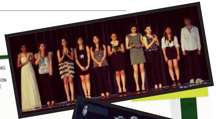
PLENTY OF GROOMING WENT INTO THE VIVACITY 2011 FASHION SHOW TO MAKE THE EVENT A TRULY COLOURFUL AND MEMORABLE EXPERIENCE.