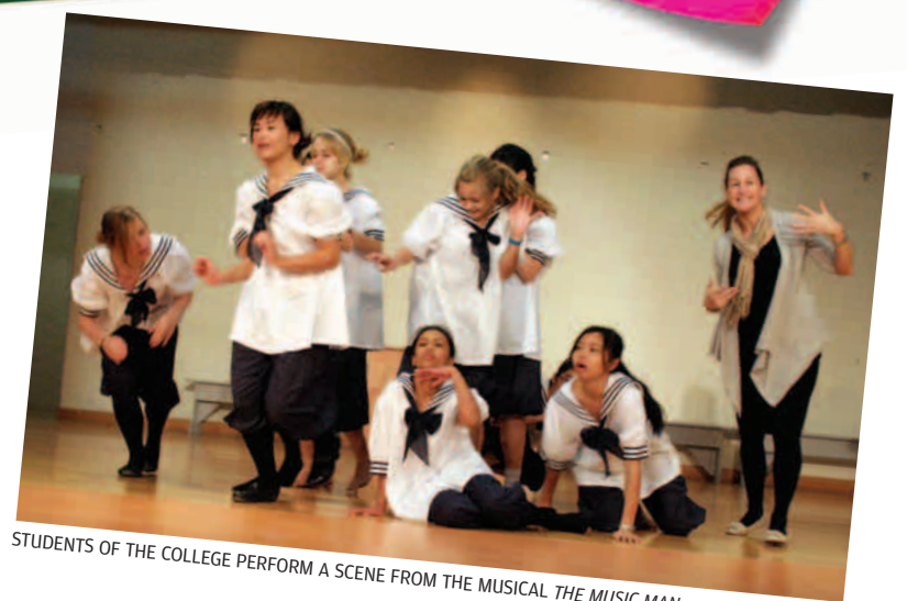
STUDENTS OF THE COLLEGE PERFORM A SCENE FROM THE MUSICAL THE MUSIC MAN .